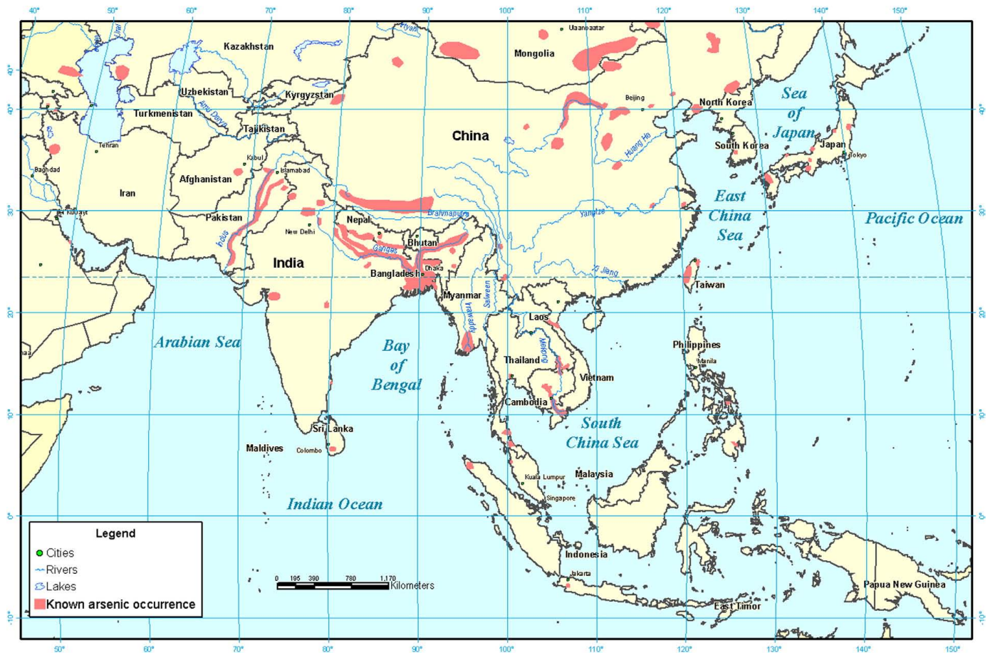
Fig. 1. Distribution of arsenic contamination of groundwater in South and South-east Asia. Arsenic occurrence data from Ravenscroft (2007a) and map data from ESRI's ArcGIS 8.0. Projection: Robinson. Note the sizes of the areas shown should not be confused with the severity or number of people affected.